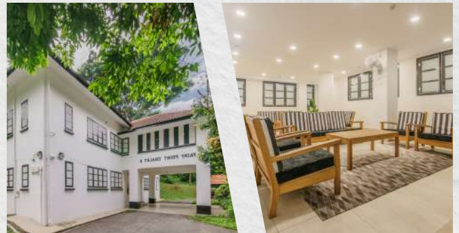
Fairy Point Chalets (4 bedrooms, 579sqm)