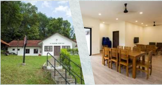
Fairy Point Bungalow (3 bedrooms, 151sqm)