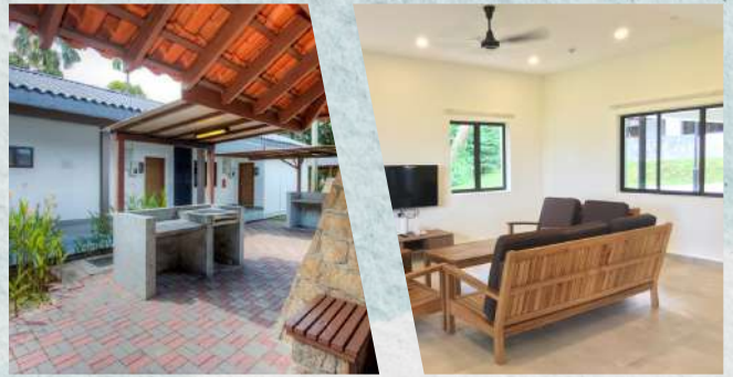
Garden Terraces (2 bedrooms, 270sqm)