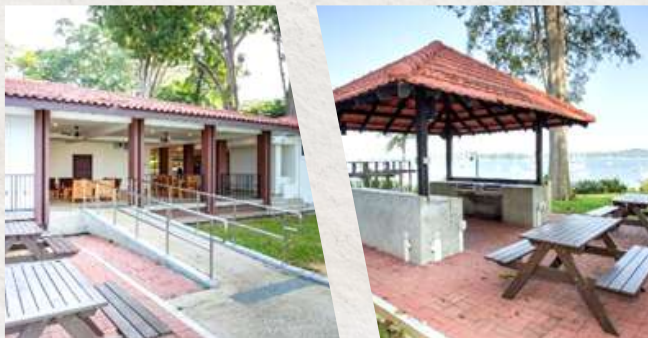
Seafront Chalets (4 bedrooms, 270sqm)