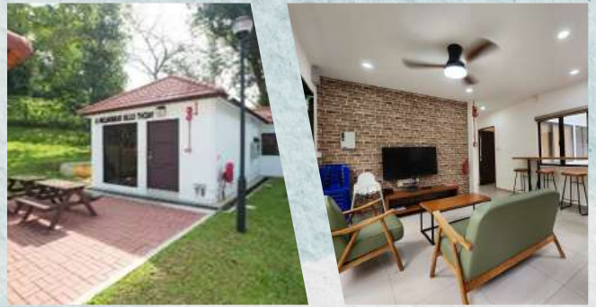
Yacht Club Bungalows (2 bedrooms, 191sqm)