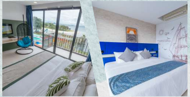
Deluxe Suite (1 bedroom, 43sqm)