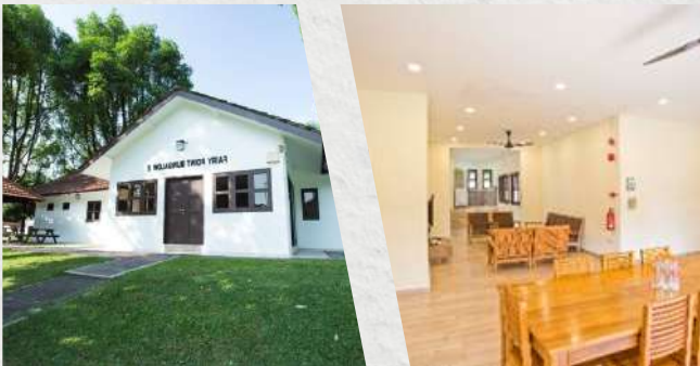
Fairy Point Bungalows (4 bedrooms, 207sqm)