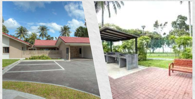
Sea View Bungalows (4 bedrooms, 286sqm)