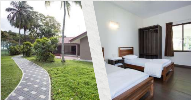
Sea View Terraces (4 bedrooms, 360sqm)