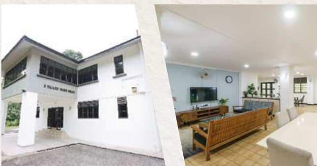
Fairy Point Chalet 6 (5 bedrooms, 633sqm)