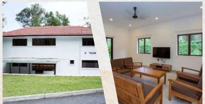
Garden Chalets (5 bedrooms, 322sqm)