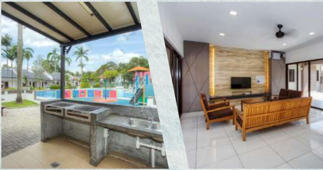
Pool Terraces (4 bedrooms, 360sqm)