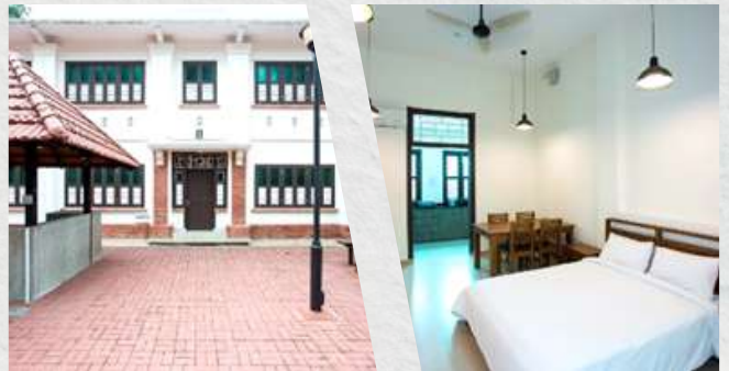
Netheravon Terraces (1 bedroom, 34sqm)