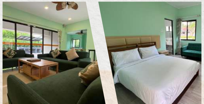
Garden Bungalows (4 bedrooms, 286sqm)