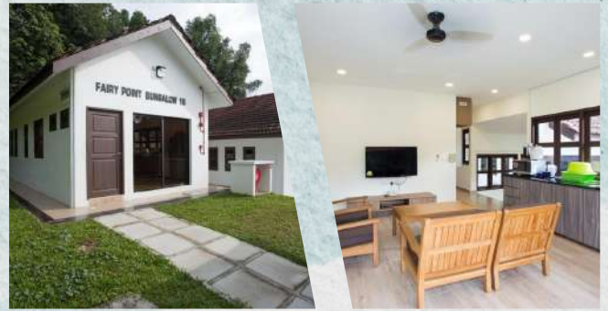
Fairy Point Bungalow (1 bedroom, 56sqm)