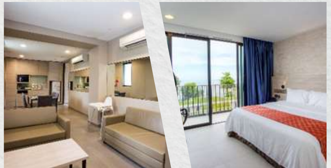
Family Suite Plus (2 bedrooms, 86sqm)