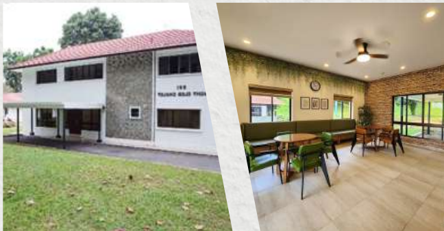
Yacht Club Chalet (5 bedrooms, 322sqm)