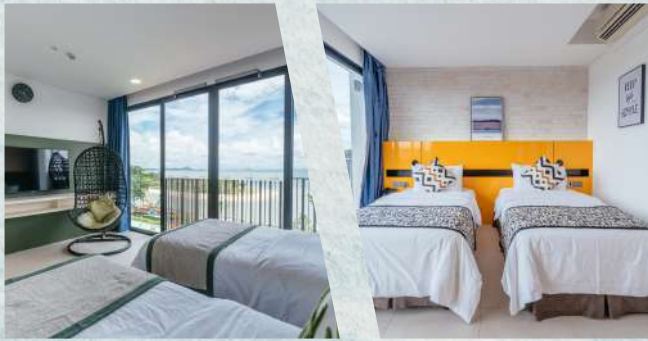
Superior Suite (1 bedroom, 43sqm)