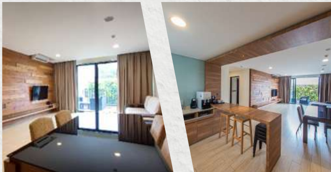
Family Suite (2 bedrooms, 86sqm)