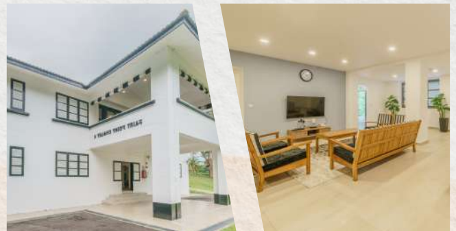
Fairy Point Chalet 4 (6 bedrooms, 579sqm)