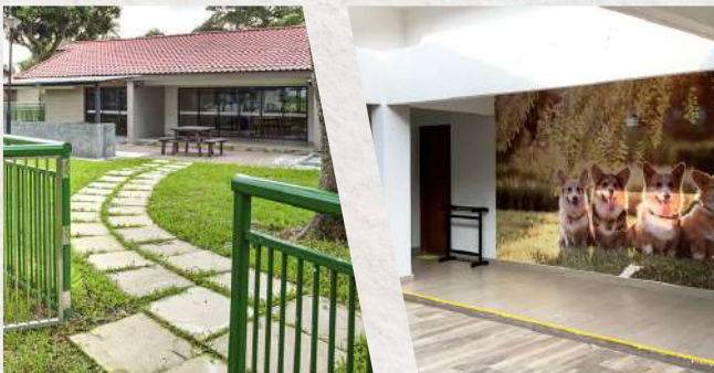
Dog-Friendly Bungalows (4 bedrooms, 286sqm)