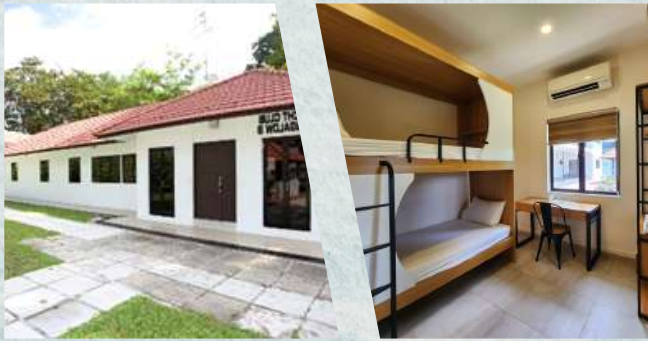
Yacht Club Bungalows (3 or 4 bedrooms, 191sqm)