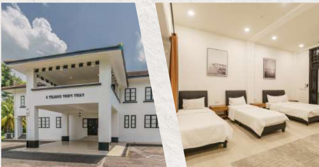
Fairy Point Chalet 3 (5 bedrooms, 579sqm)